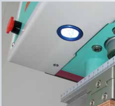
LED light for work area