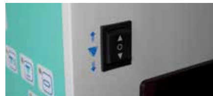
above: adjustment pad stroke below: interface