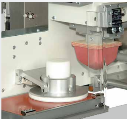
ink-cup without viscomat