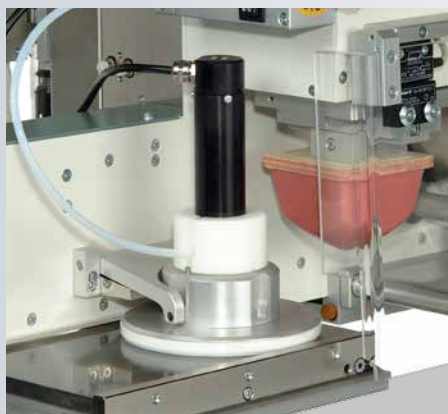
ink-cup with viscomat